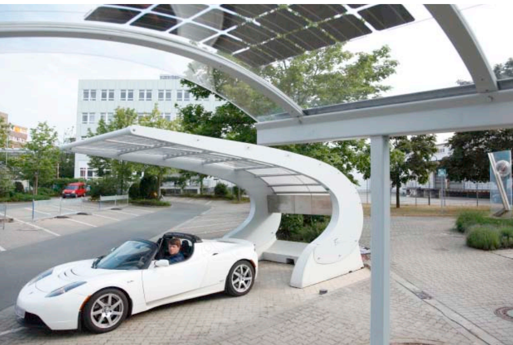
The SUNOVATION ECO TECHNICS carport combines design with functionality in an attractive way. Foreground a PLEXIGLAS® solar roof for the bicycle shelter.

A carport designed for Evonik was recently installed on the premises of the Darmstadt site directly in front of the new light-weight design studio in which Evonik presents sophisticated plastic components for applications in the automotive industry, aviation, solar technology, and architecture. An appropriate environment for the solar carport, which rises upwards in an elegant arch. Its eight-square-meter photovoltaic surface allows enough power to